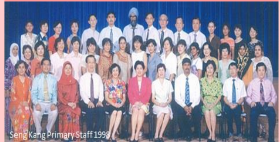
The Pioneers of Seng Kang Primary School