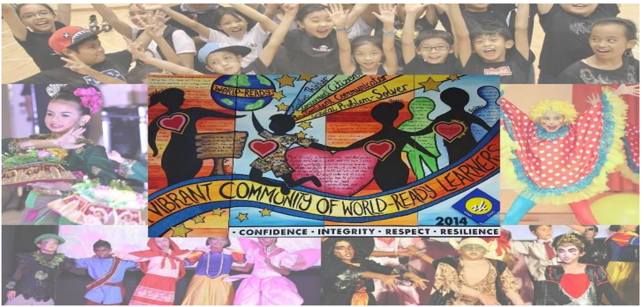
“Viva Esperienza – Let’s Build a School Together” celebrating the completion of upgrading projects in 2014