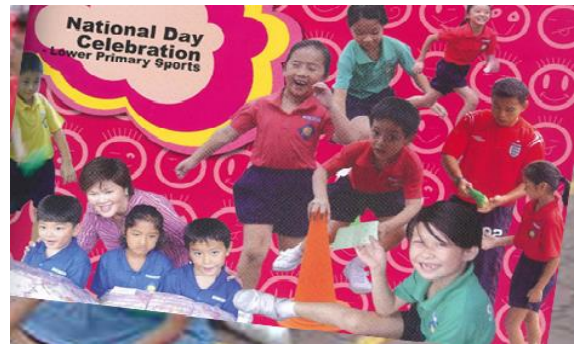
Seng Kang Primary School Uniform from 2005 to 2011