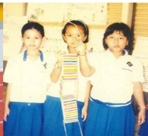
Seng Kang Primary School Uniform from 1997 to 2004