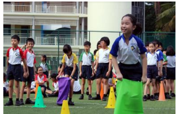
Seng Kang Primary School Uniform from 2012 to Present