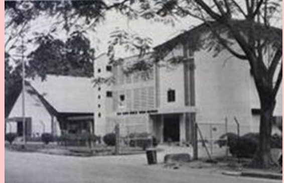
Where it all began... The school started its operations in Jan 1997 at the site of the former Hai Sing Girls' High School along Upper Serangoon Road